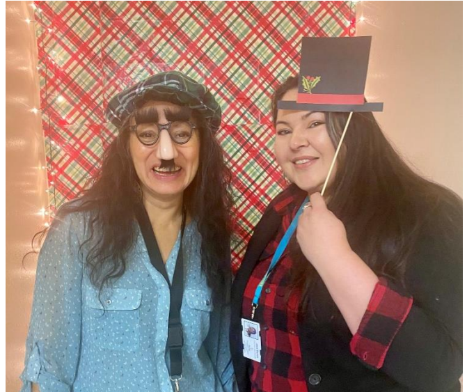
That one time we attended the SOESD Holiday party!